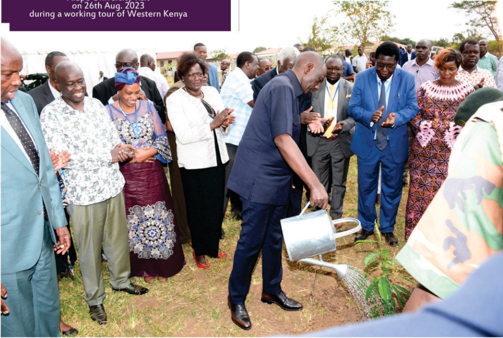
H.E. President William Ruto Alupa University visit on 26th Aug. 2023 during a working tour of Western Kenya